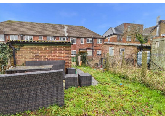
Garden to rear